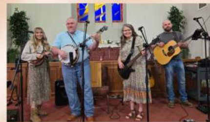
Music Guests - Harper Collective