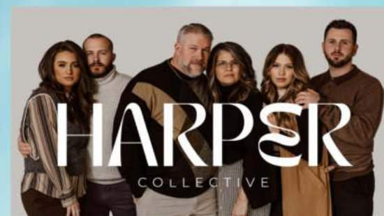
Music Guests - Harper Collective