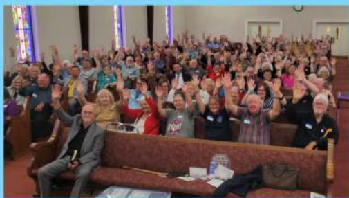
Big Creek Baptist Church, Soso, Mississippi